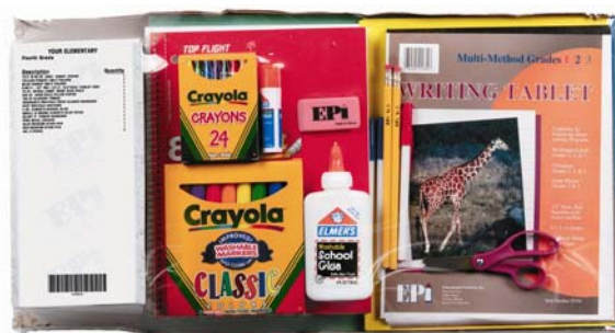
3rd, 4th and 5th grade pre-packs

Thank you for helping our local students begin their school year with the supplies they need to succeed!